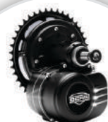
250W engine With torque sensor