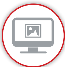
2. Media bank