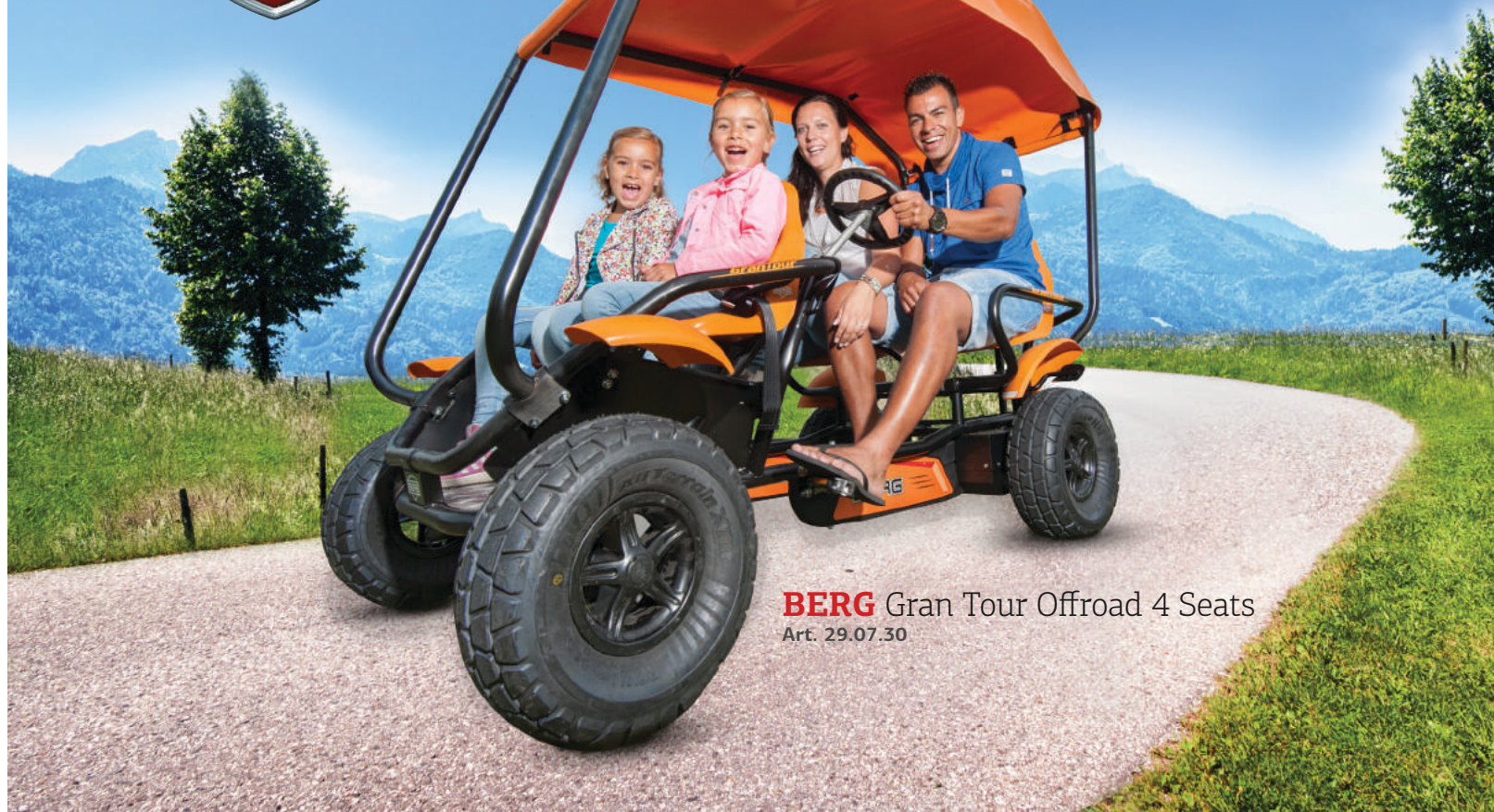
BERG Gran Tour Offroad 4 Seats Art. 29.07.30

The model shown is displayed with a sunroof. This can be ordered separately.