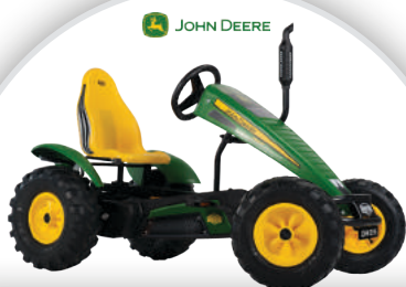
BERG John Deere BFR Art. 07.11.00 | Age 5 and up