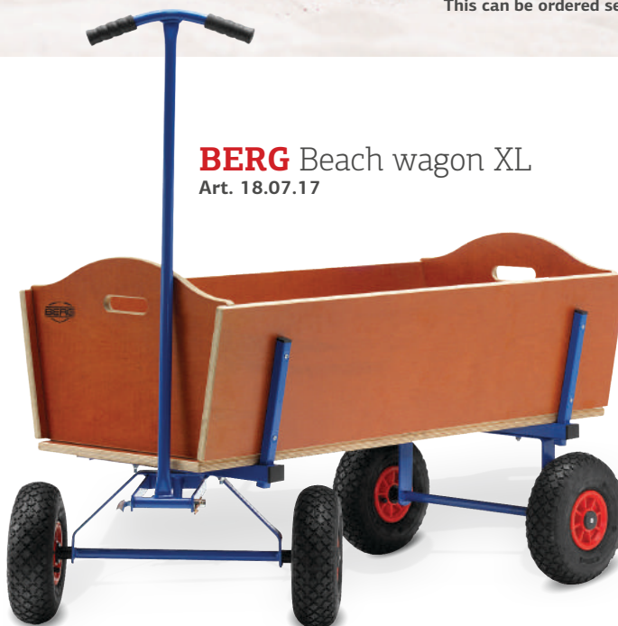
BERG Beach wagon XL Art. 18.07.17