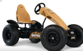
BERG Safari BFR Art. 07.10.07 | Age 5 and up