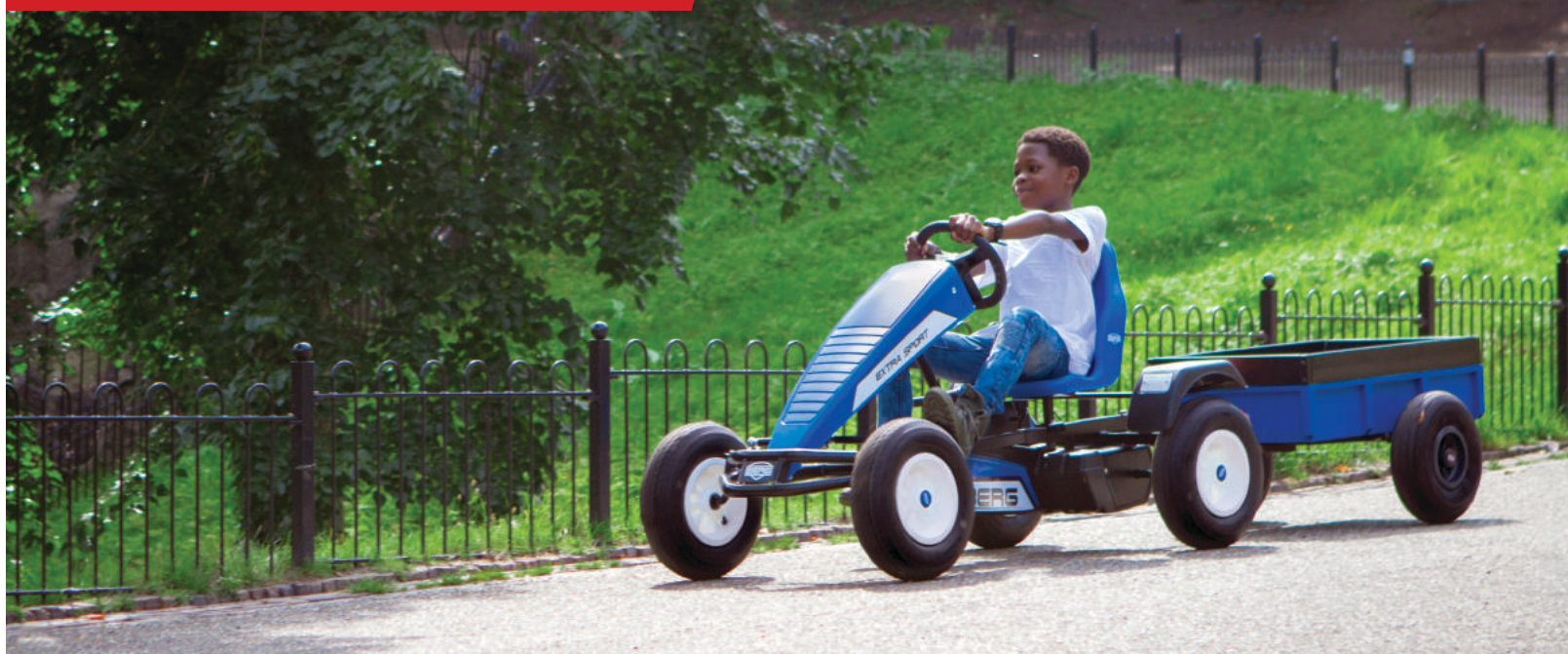
BERG Steel Trailer Art. 18.08.02