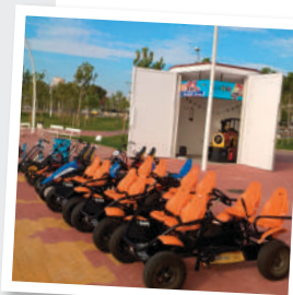
Spain: Formula Outdoor Karting

“We have been using BERG Products for a while now and I can say that we have made the right choice. Rough terrain is no problem at all for BERG Go-karts.”