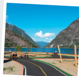
Norway: Motorikpark & rental campsite

“In recent years, we have achieved approximately 2,000 rental hours in the peak season. The tourists and the people in the neighbourhood love BERG Go-karts!”