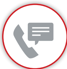
3. Expert support