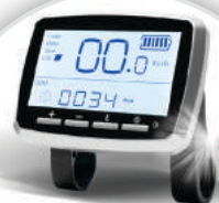
LCD Display with Speedometer and distance meter, battery capacity