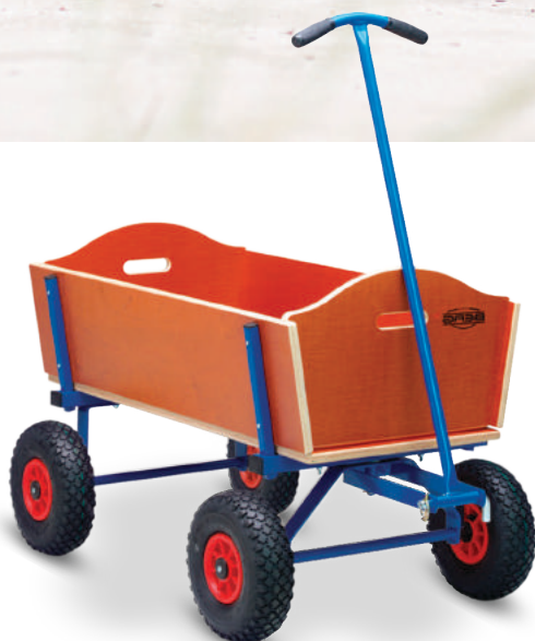
BERG Beach wagon L Art. 18.07.10

The model shown is displayed with a Western Cover. This can be ordered separately.