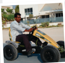
Dubai: BYKY Sport & Leisure Equipment

“BYKY started a rental station in 2005 with a number of BERG Go-karts on the beach. The people were very enthusiastic and demand was high! This encouraged us to set up more rental stations.”