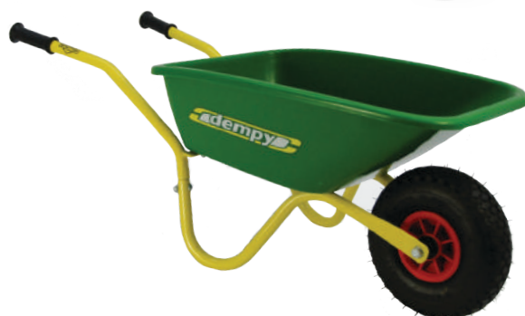
BERG Dempy Art. 25.17.00

BERG reserves the absolute right to make changes to the products described and/or depicted in this brochure. No part of this brochure may be reproduced without written permission from BERG. Printing and typesetting errors reserved. Art No. 49.68.01.87. Copyright BERG Toys B.V. 2018-2019.