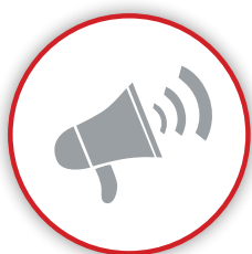
1. Marketing and promotional materials

A warranty period of 1 year for the frame and parts applies to BERG Products for the rental market. The warranty does not cover wear parts.